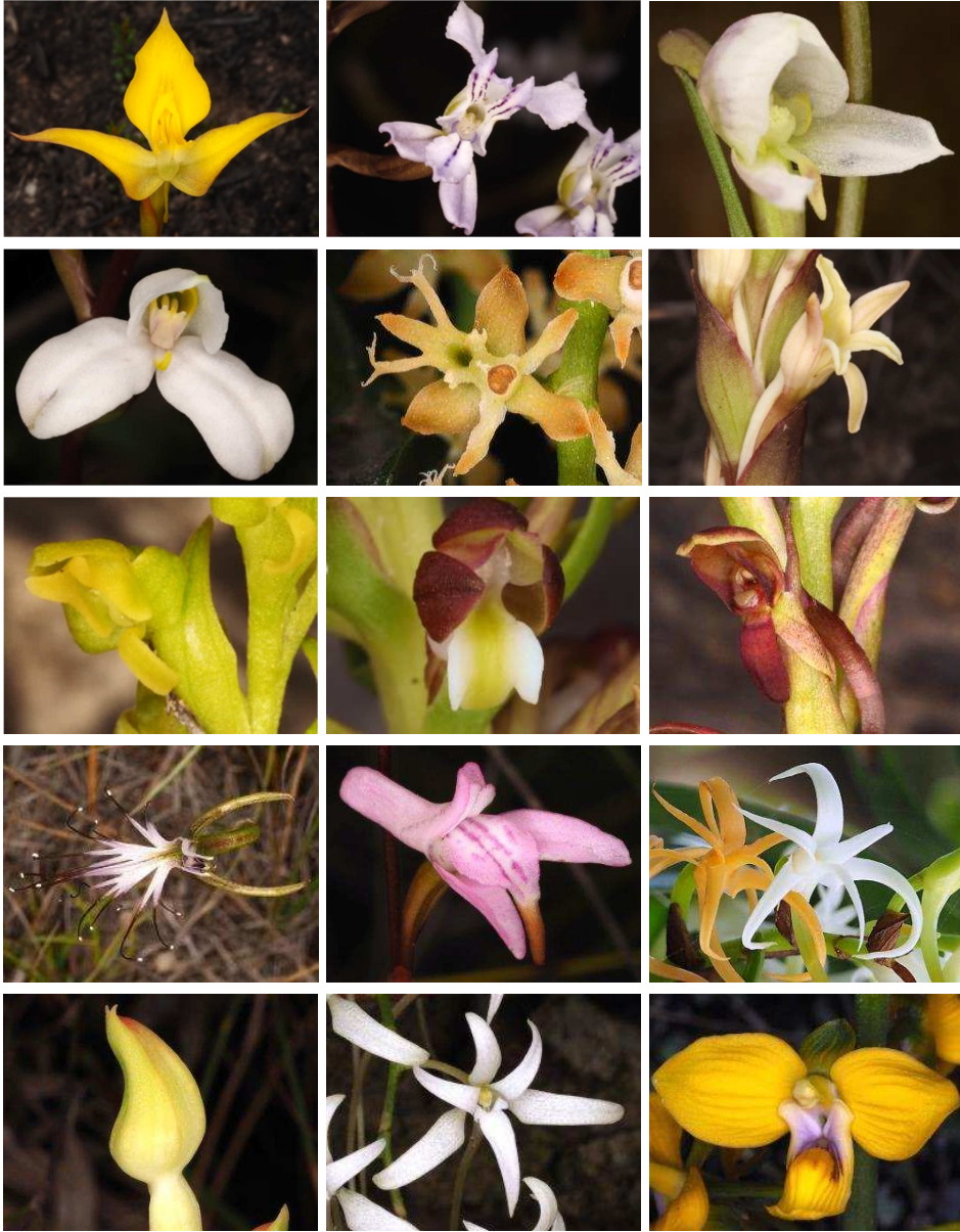
Disa tenuifolia Disa tripetaloides (weißblühende Form) Disa cylindrica Bartholina etheliae Pterygodium cleistogamum