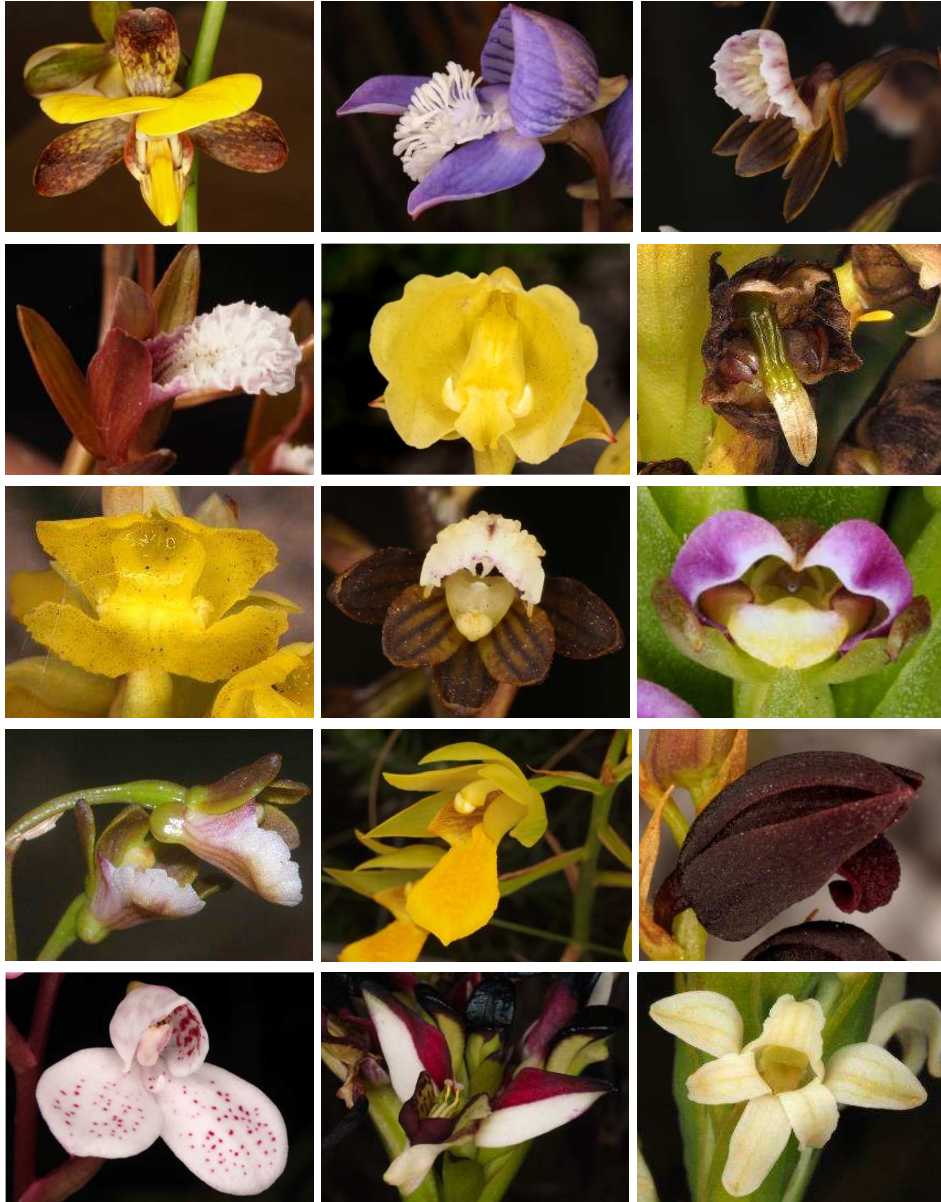
Eulopia streptopetala Acrolophia lamellata Pterigodium cafferum Acrolophia micrantha Disa tripetaloides