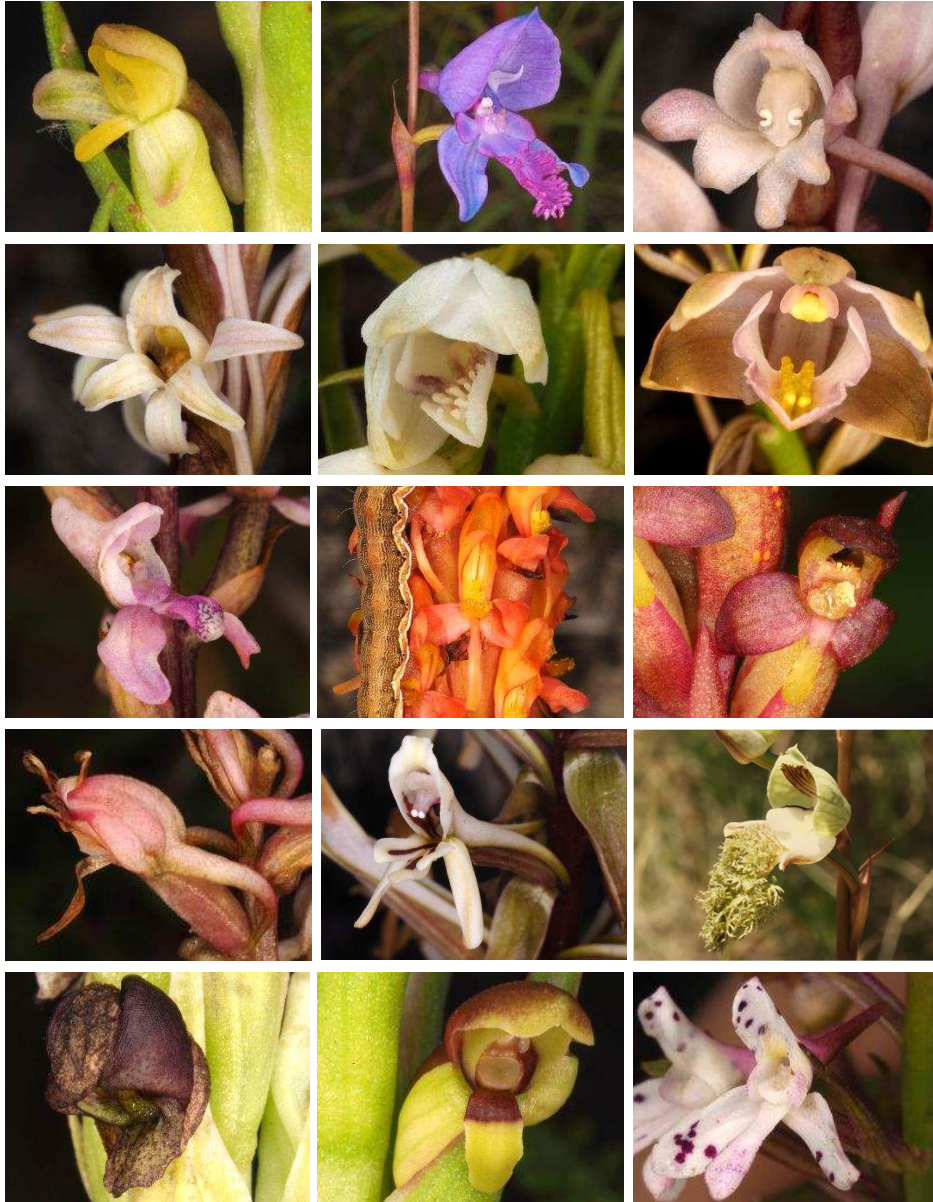
Disa bracteata (S 28) Satyrium stenopetalum subsp. stenopetalum Disa aconitoides Satyrium ligulatum Corycium dracomontanum