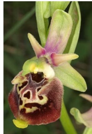
Ophrys holoserica subsp. dinarica