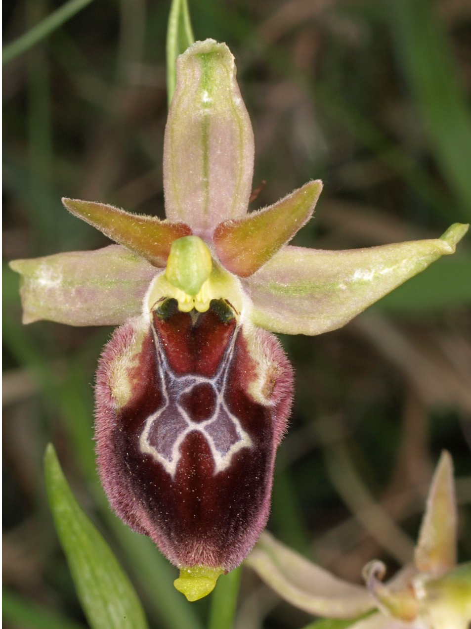
Ophrys holoserica subsp. dinarica x Ophrys sphegodes subsp. sphegodes