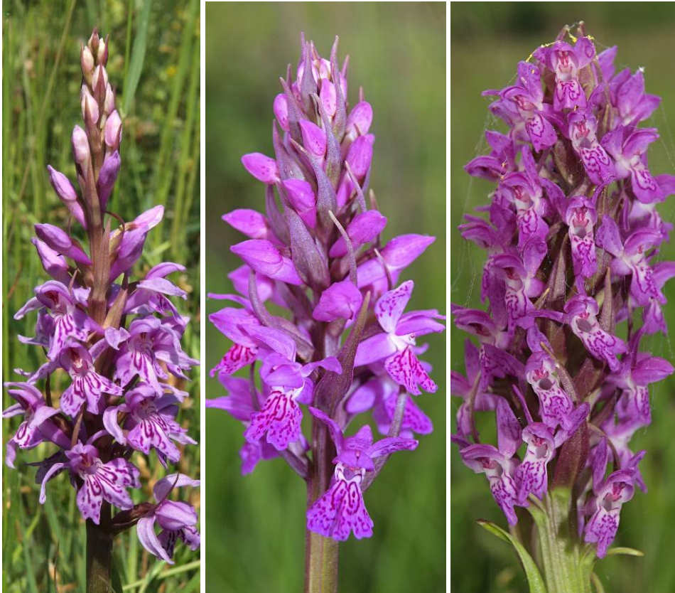
Dactylorhiza maculata subsp. saccata , Dactylorhiza incarnata subsp. incarnata und Hybride (m)