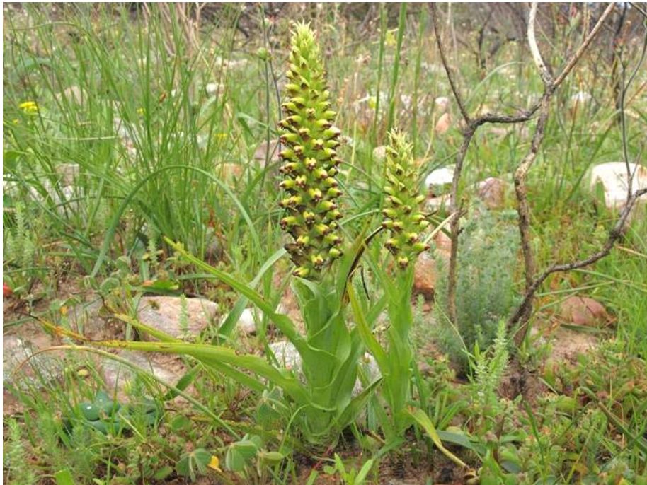
Disa pygmaea und Corycium orobranchoides