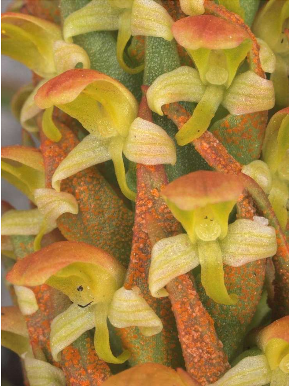
Disa pygmaea mit Rostpilz